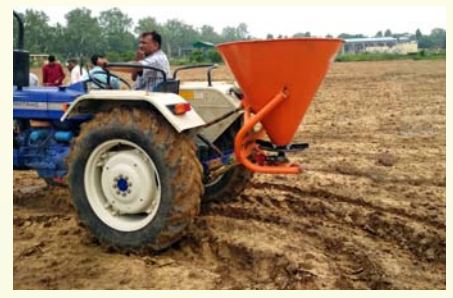
Tractor Mounted Fertilizer Broadcaster

A field demonstration of commercially available Tractor Mounted Fertilizer Broadcaster was organized at IARI research farm on July 26, 2017 by the Institute's Farm Operation Service Unit (FOSU). The machine was also tested for broadcasting of dhaincha ( Sesbania bispinosa ) seed. The machine has a tank capacity of 600 kg and can be operated with 35 HP tractor through PTO. The field capacity is estimated to about 5-6 ha/h as it can be operated at 5-7 km/h forward speed covering