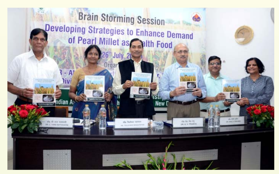
Release of a technical bulletin entitled "Enhancing Demand of Pearl Millet as Super Grain" during the Brain Storming Session