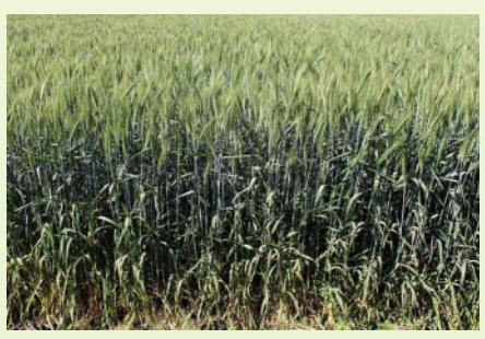
A bread wheat variety HI 1612

HI 1612 is a bread wheat genotype identified for release under timely sown, restricted irrigation conditions of North Eastern Plains Zone. It is a significantly high yielding variety (3.76 t/ha) compared to checks K 8027 (3.36 t/ha), C 306 (3.10 t/ha) and HD 2888 (3.03 t/ha) under timely sown and restricted irrigation (RI) conditions with yield potential of 5.05 t/ha. It has shown excellent and wider adaptation and significantly superior performance across different irrigation regimes. It showed significantly high yield gain at one irrigation (32.4 %) and two irrigations (52.4%) over no