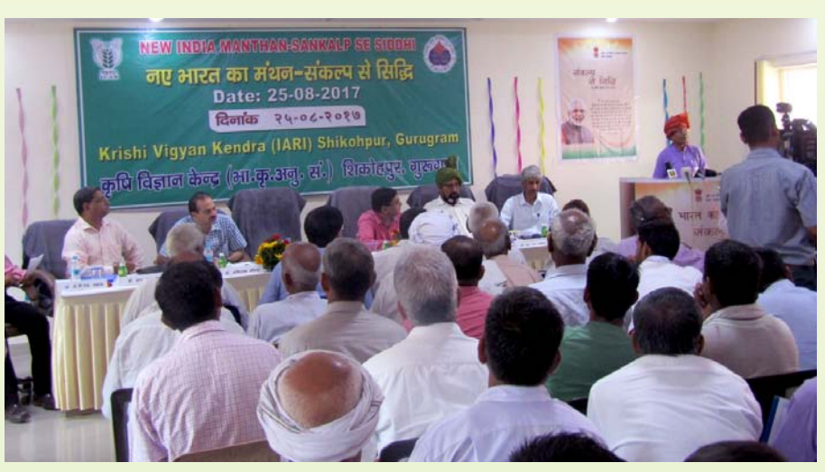
A programme on New India Manthan: Sankalp Se Siddhi

The Institute's Division of Agronomy organized two Summer Schools on: i) "Integrated Farming Systems for Farmers Empowerment and Entrepreneurial Development" (June 23 to July 13, 2017); and ii) "Waste to Wealth: Biocompost Production and Utilization Innovations in Organic Agriculture" (August 10 to 30, 2017).