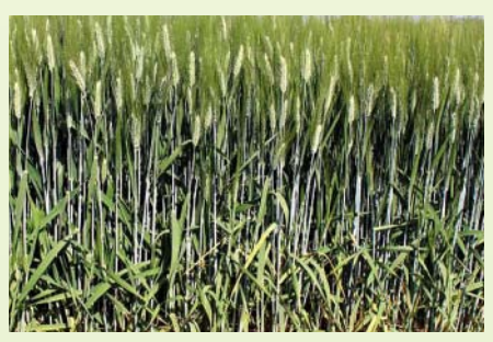
A durum wheat variety HI 8777

HI 8777 is a durum wheat genotype identified for release under rainfed, timely sown conditions of Peninsular Zone. It is widely adapted and high yielding (1.85 t/ha), compared to checks AKDW 2997-16 (1.62 t/ha) and UAS 446 (1.62 t/ha) under rainfed, timely sown conditions with yield potential of 2.88 t/ha. It showed